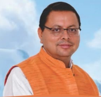
Pushkar Singh Dhami Chief Minister