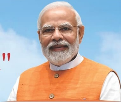
Narendra Modi Prime Minister